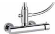
Monocomando da barra. Interasse 150 mm. Round mixer. Interaxis distance 150 mm