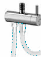
Presca acqua tonda special per alimentazione esterna. Special water supply for external water inlet.